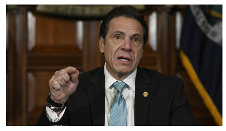
Cuomo Not Sold on Mobile Sports Betting