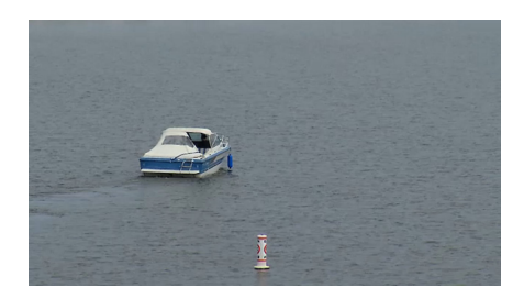
Concerns Remain As New York Boat Safety Bill Sails On